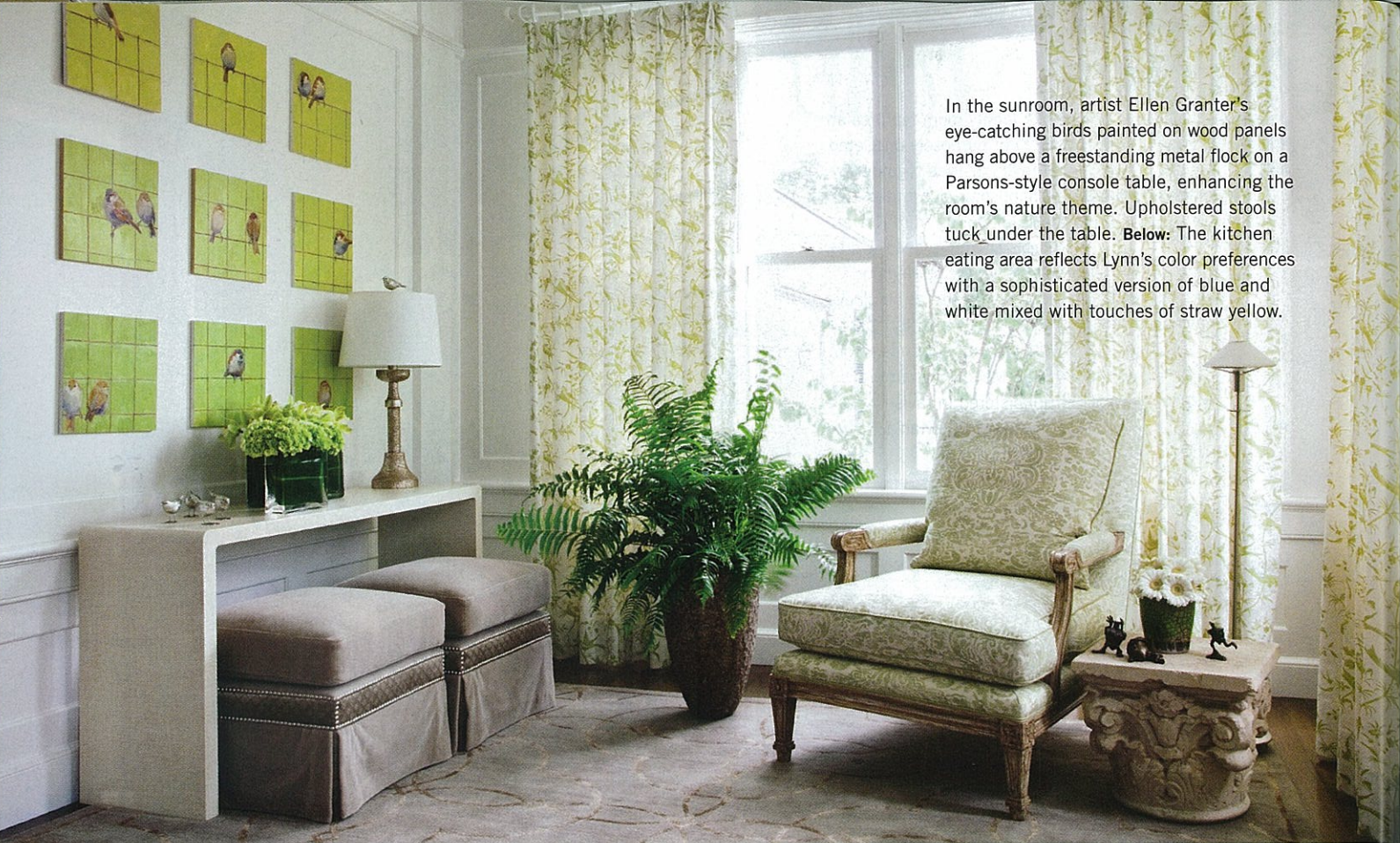
In the sunroom, artist Ellen Granter's eye-catching birds painted on wood panels hang above a freestanding metal flock on a Parsons-style console table, enhancing the room's nature theme. Upholstered stools tuck under the table. Below: The kitchen eating area reflects Lynn's color preferences with a sophisticated version of blue and white mixed with touches of straw yellow.